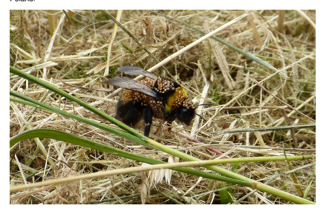
Fig. 1. Bombus lucorum queen, Tórshavn, Aug. 21st, 2016, infested with deutonymphs of the mite Parasitellus fucorum.

Anatomy, Institute of Zoology and Biomedical Research, Jagiellonian University, Kraków, Poland.